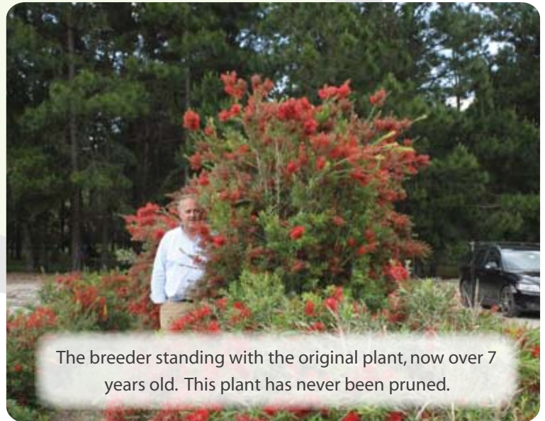
The breeder standing with the original plant, now over 7 years old. This plant has never been pruned.